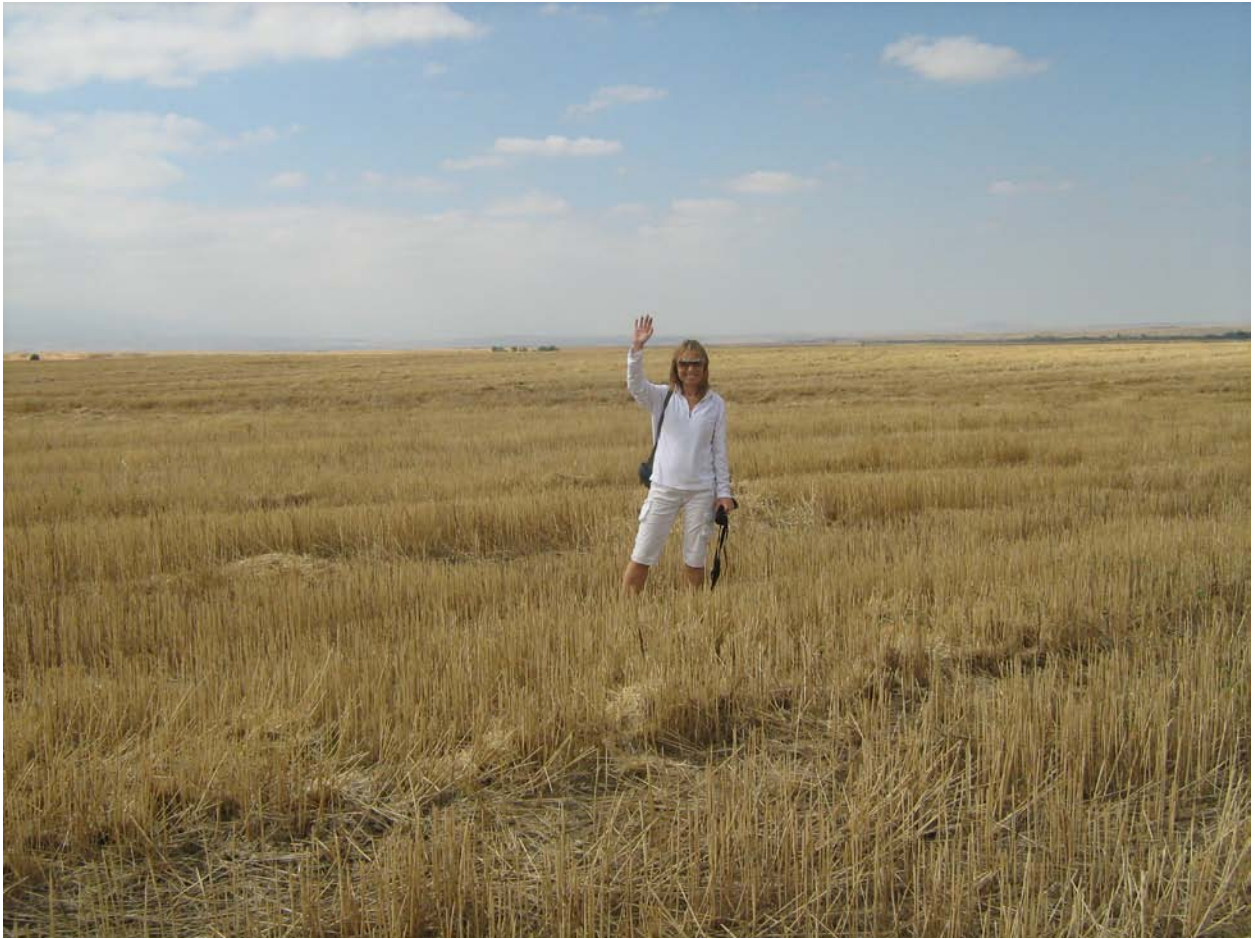
Figure 2 Author visiting a winter wheat field in Kazakhstan shortly after the harvest