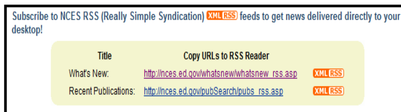
Figure 1 – NCES Subscription Information